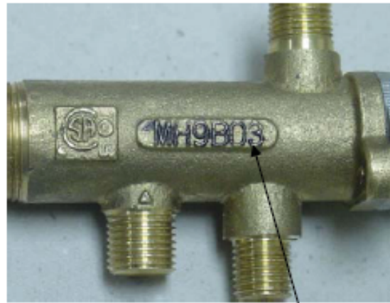
Fig. 2 Part #73482 Casting #MH9B03