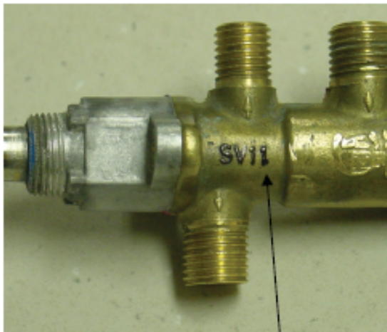
Fig. 3 Part #73983 Casting #SV11 No longer available