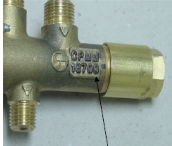
Fig. 4 Part #73492 Casting #18700